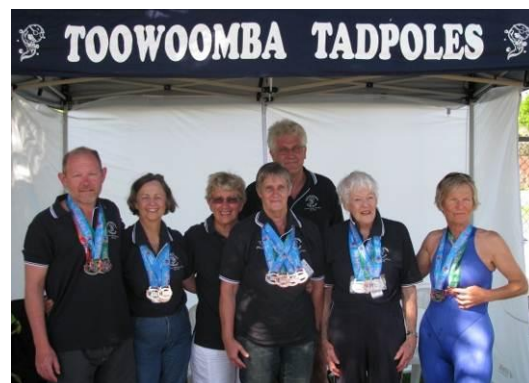
The 2010 team