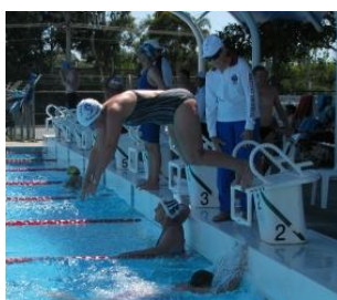
Relay change 2