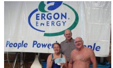
Dash for Cash Winners

swimmers (except with maybe the advantage of experience), as all teams were time handicapped based on their 50m freestyle times. In a close finish, they once again took away the “first team home” prize of $100 donated by ERGON ENERGY (many thanks Ergon).